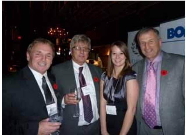
Fall Networking Social