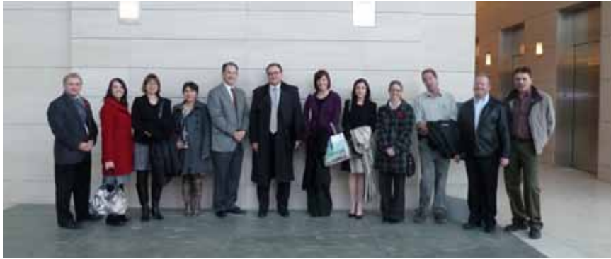
Eighth Avenue Place Building Tour