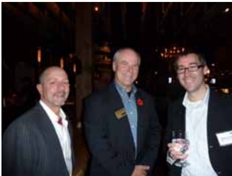
Fall Networking Social